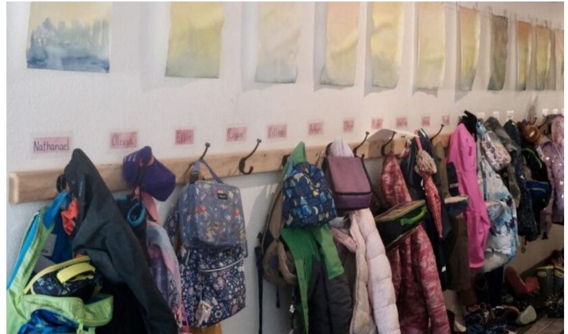
Boreal Sun Charter School in Fairbanks on April 22, 2024