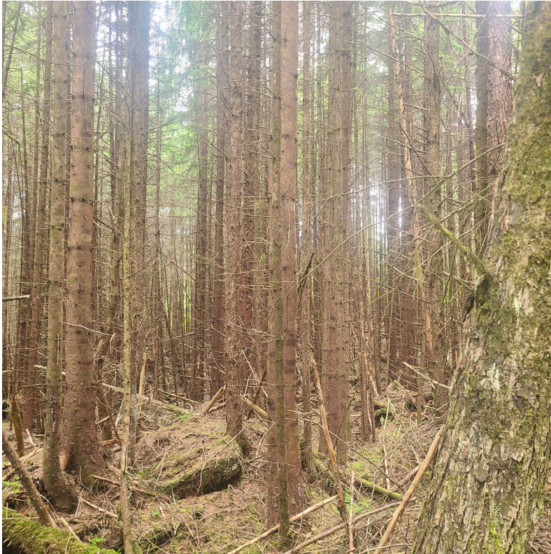
Un-thinned 30-year-old stand, Southeast State Forest