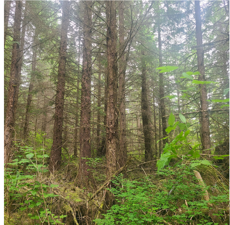
Thinned 30-year-old stand, Southeast State Forest