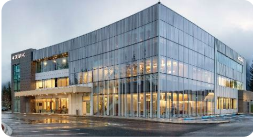
Vintage Park Campus, Juneau