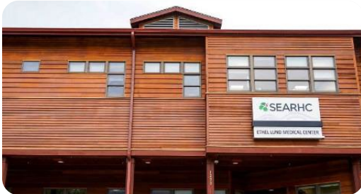
Ethel Lund Medical Center, Juneau