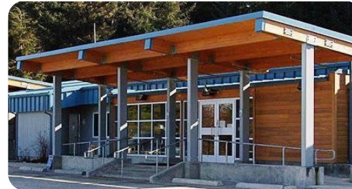
Alicia Roberts Medical Center, Klawock