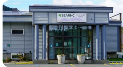
Haines Health Center