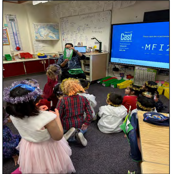
Kusamasiluataumausi! Reading each Christmas card for parents. Inupiaq immersion class, Nome Public Schools 2023.

The Council recommends that all graduates of high school in Alaska’s public schools take at least one semester of an Alaska Native language. This can be done through asynchronous methods and also can be done via distance so students can choose which language they would like to take. This would normalize Alaska Native languages in public education in ways that no single other move could, and the method of doing so is proposed be editing the following Alaska Statute: