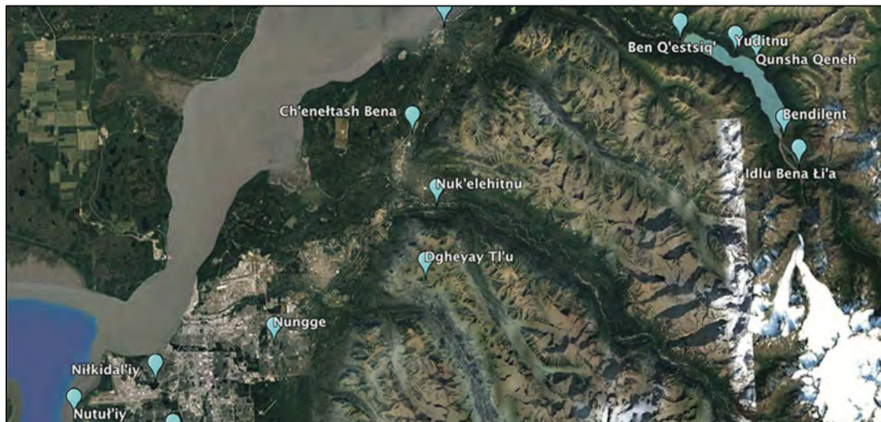
Place names in the Municipality of Anchorage that are being restored.

https://www.adn.com/alaska-news/anchorage/2023/08/25/new-anchorage-signpost-explaining-denaina-place-name-is-part-of-broader-movement/