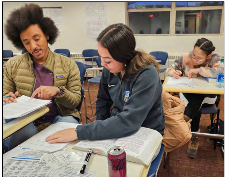
UAF's Advanced Yugtun students. Foreground: Nalugalria from Seward/Cev'aq and Iyakik from Iliamna. Background: Ciukiq from Akiacuar

GOV: Declare Alaska Native Languages Day, reconfirm the declaration of State of Linguistic Emergency for Alaska Native languages in 2018, include Alaska Native languages in more statements made to the public, and express a commitment to the health and future of Alaska Native languages. Reaffirm within each State department that the State of Linguistic Emergency stands (A.O. 300) and make a formal commitment to the health and future of Alaska Native languages.