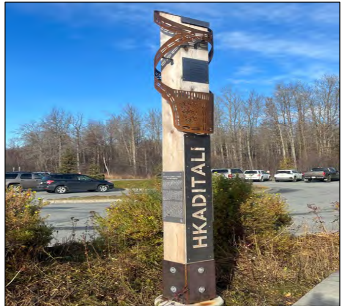
Hkaditali ("Drift Lumber"), restored Dena'inaq' place name for a place where driftwood was traditionally collected; nowadays near the current Potter Marsh parking lot in Anchorage.

The Council proposes that this project be carried out in two phases that are each made up of two interrelated processes. Phase One is a high priority name restoration and Phase Two might take more time and effort in order to complete. Throughout the process, the Council urges the State of Alaska to partner with Alaska Native language teachers to educate the public on spelling and pronunciation of Indigenous place names. This phase consists of two parts.