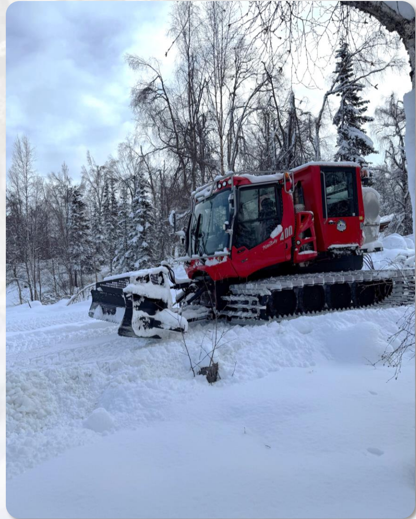
Grooming operations March 2025