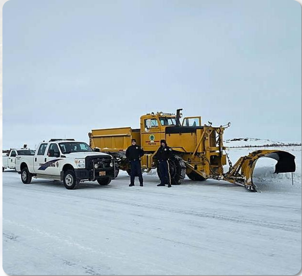
Kuskokwim Ice Road sponsored by Napaimute. March 2025