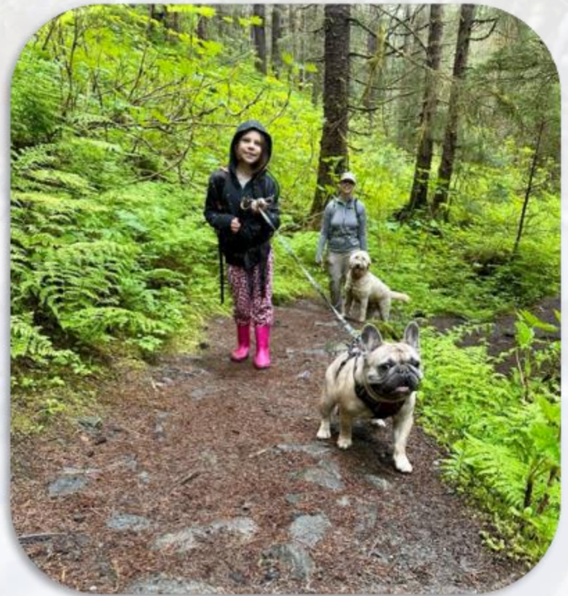
Multi-use trails for recreation and access.