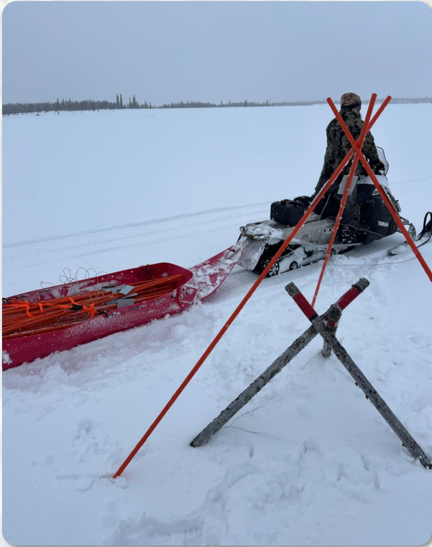
Trail marker near Ekwok, March 2024