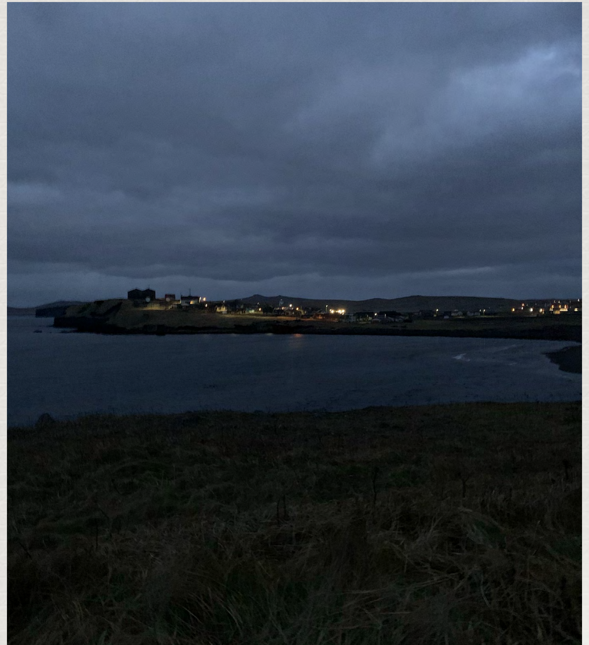
St. Paul Island, 10:00 am November 2, 2019, AK Daylight Time

Most Alaskans wake in the dark to go to school and work. This enforced sleep deprivation has consequences.