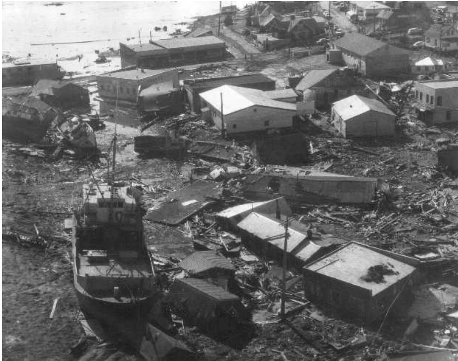
Above: Valdez after the 1964 earthquake.