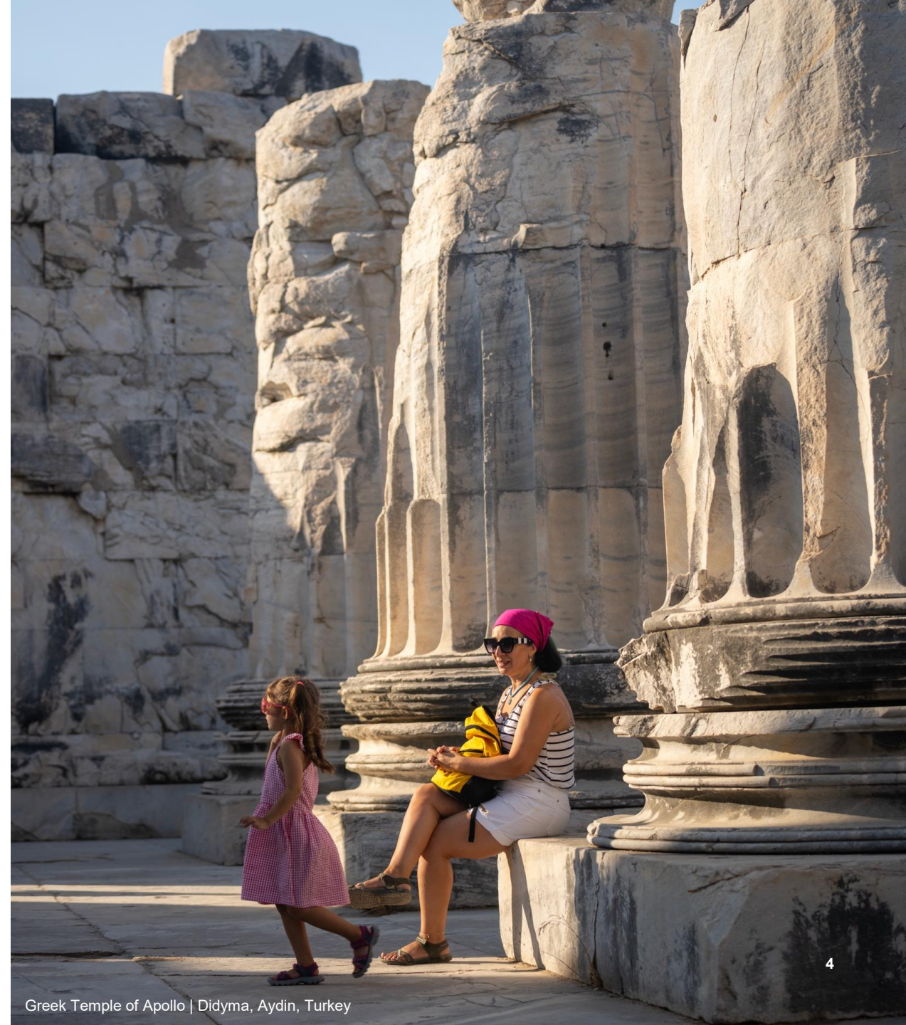
Greek Temple of Apollo | Didyma, Aydin, Turkey