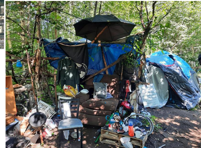
Photo: Business Park Wetlands 2025 trespass camp