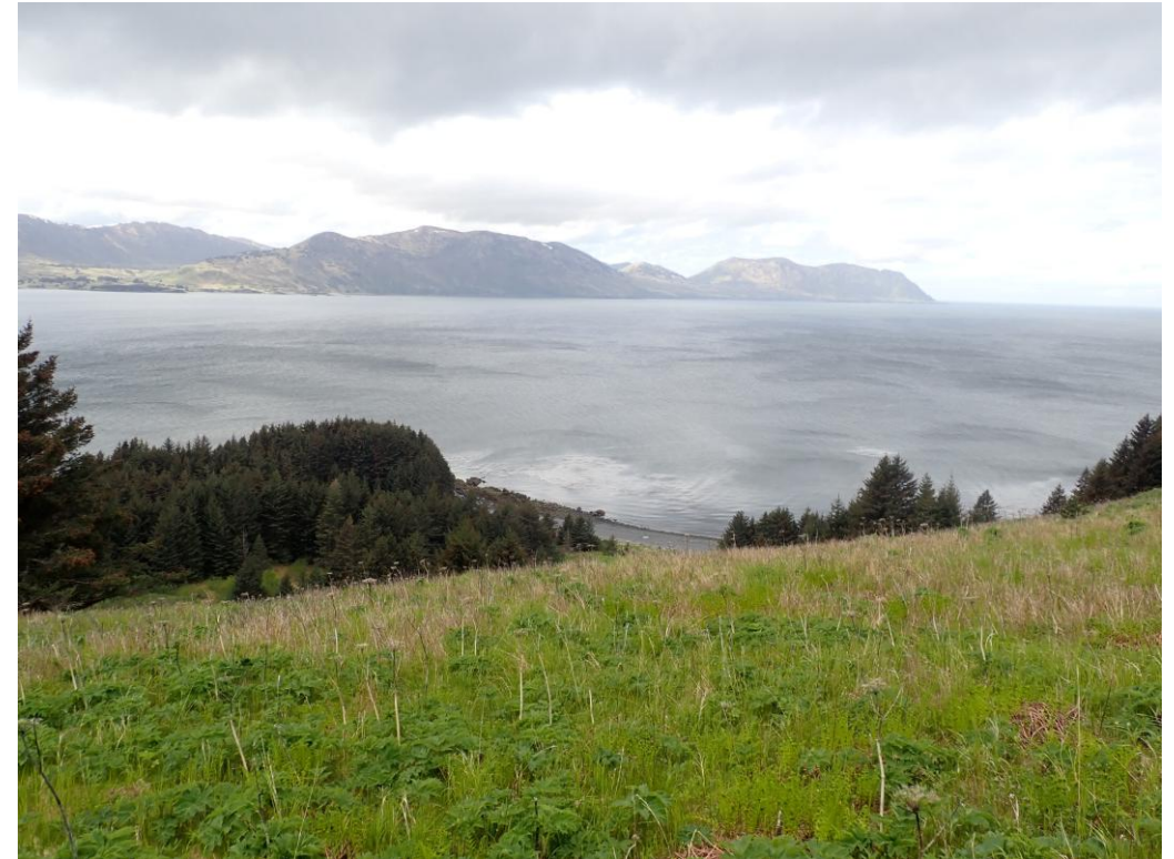
Image: Kupreanof Shores on Kodiak Island