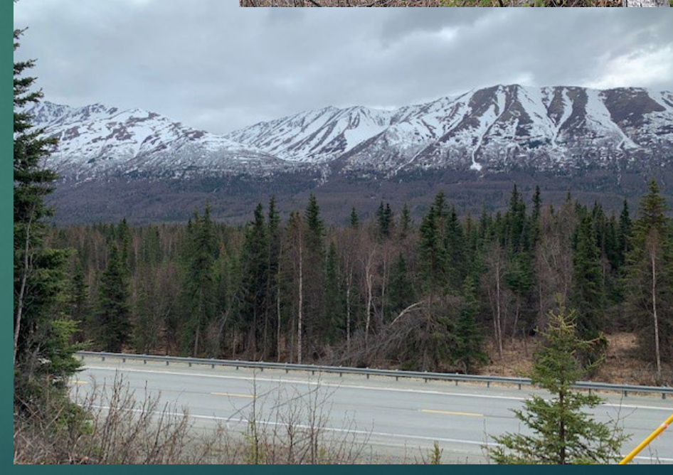
Parcel 3 – steep hillside and Eagle River Rd