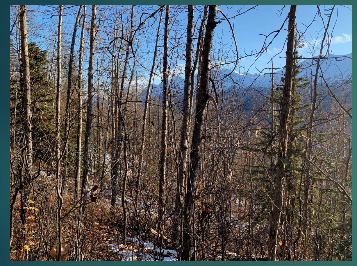
Parcel 2 – steep hillside and view across Eagle River from parcel 2