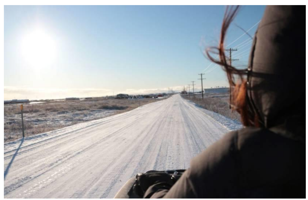
Four-wheeling down Front St. in Nome, fall 2020.