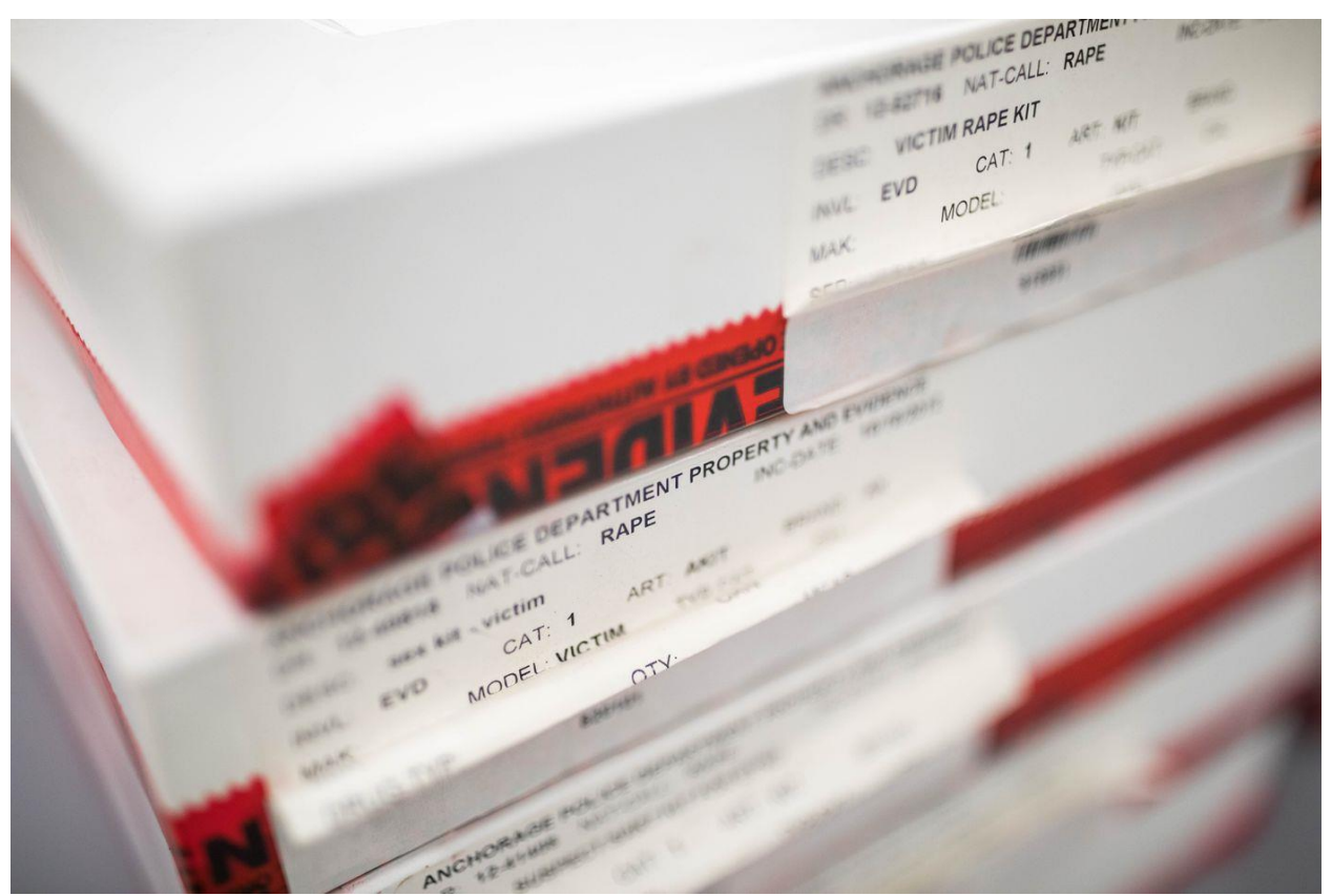
Rape kits stacked in the Alaska State Crime Lab in 2019. Though Alaska has a backlog of DNA from rape kits like these, law enforcement agencies across the state have failed to collect DNA from people arrested for violent crimes.

This article was produced in partnership with ProPublica as part of the <u>ProPublica Local</u> <u>Reporting Network</u> and is part of a continuing series, <u>Lawless: Sexual violence in Alaska.</u>