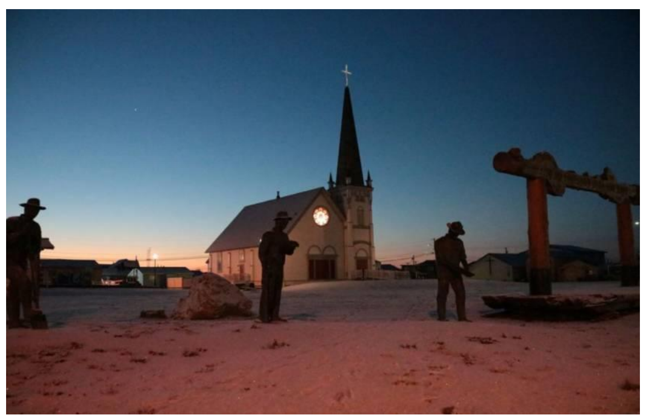
Anvil City Square in Nome at sunset in 2020.

Some residents say despite Alaska Native settlement in Nome for thousands of years, European history has overwritten Indigenous history, as seen in the town's square honoring the "Three Lucky Swedes" who found gold on Anvil Creek, attracting an extractive gold mining industry to Nome that still exists today.