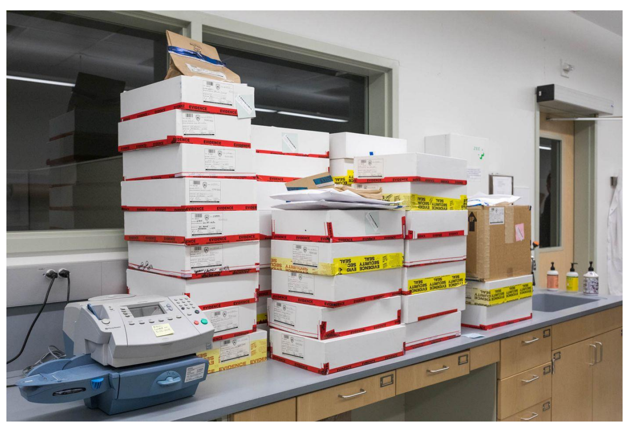
Rape kits stacked in the evidence storage area of the Alaska State Crime Lab in Anchorage in 2019.

This article was produced in partnership with ProPublica as part of the <u>ProPublica Local</u> <u>Reporting Network</u> and is part of a continuing series, <u>Lawless: Sexual violence in Alaska.</u>