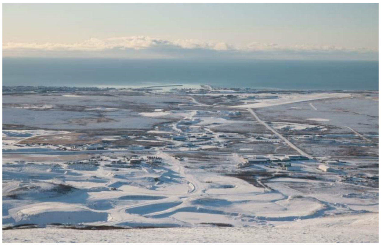
Nome seen from Anvil Mountain in fall, 2020.

Instead of vindication through the criminal justice system, many survivors in Nome are turning toward telling their story as a form of justice, empowerment and healing.