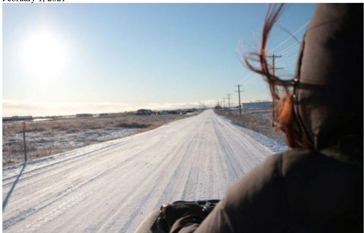
Four-wheeling down Front St. in Nome, fall 2020.

Content warning: this story contains sensitive subject matter.