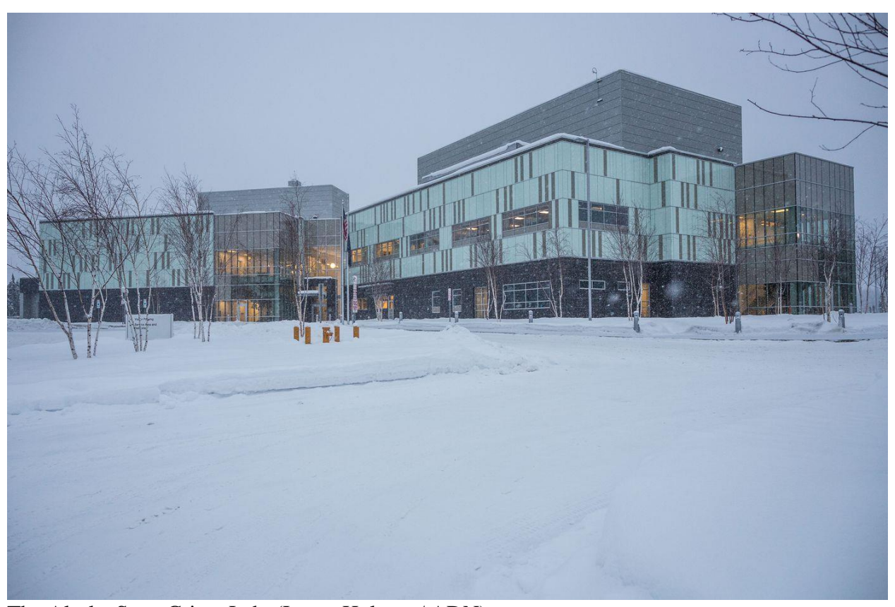
The Alaska State Crime Lab.

The state crime lab expected the new law to increase DNA samples by 70% and called for about $400,000 a year in additional funding to handle the extra work.