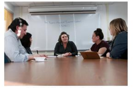
Administration & Finance