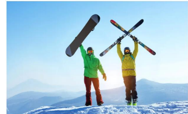
The PFAS in ski wax helps athletes slide faster down the hill.

Alaska Senate Resources Committee 16 February 2022