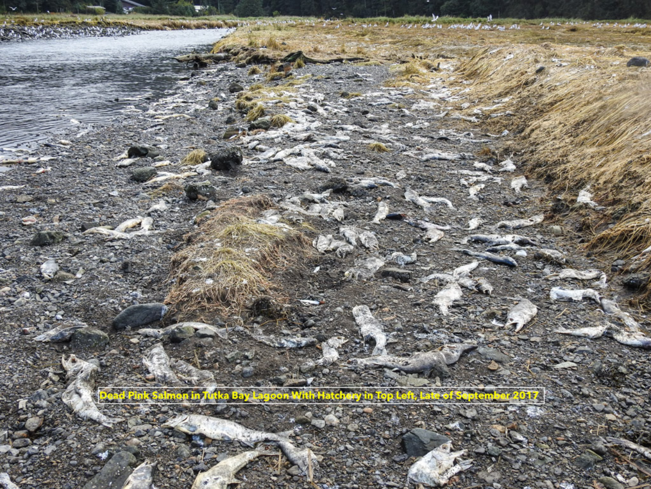
Dead Pink Salmon in Tutka Bay Lagoon With Hatchway in Top Left, Late of September 2017