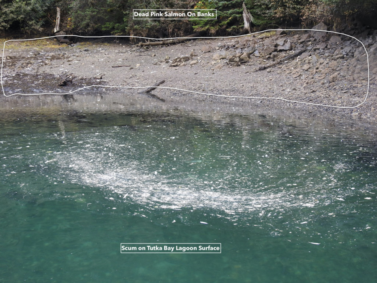
Scum on Tutka Bay Lagoon Surface