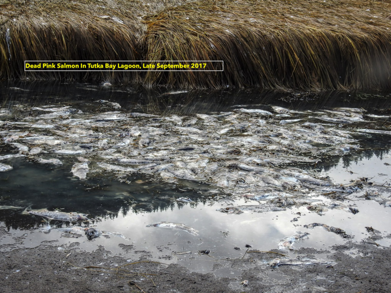
Dead Pink Salmon In Tutka Bay Lagoon, Late September 2017