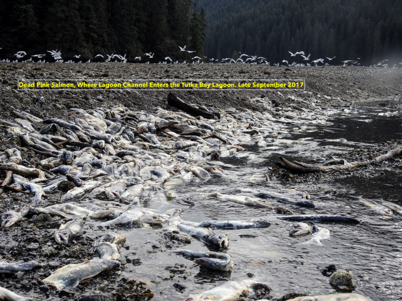
Dead Pink Salmon, Where Lagoon Channel Enters the Tutka Bay Lagoon. Late September 2017