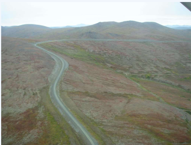
East Fork Pass: 16,350 Acres 60 Staking Authorizations