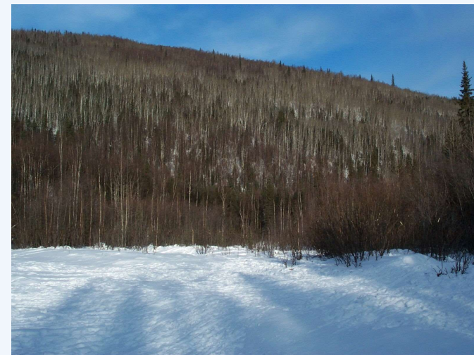
Far Mountain: 44,800 Acres 50 Staking Authorization