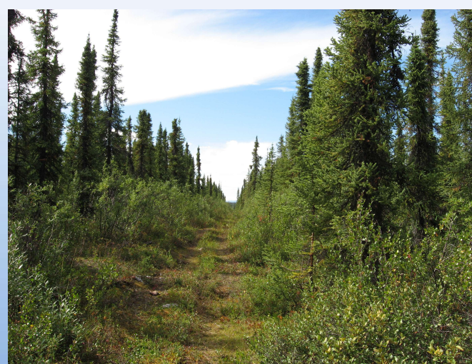
Lake Louise East: 39,840 Acres 35 Staking Authorizations