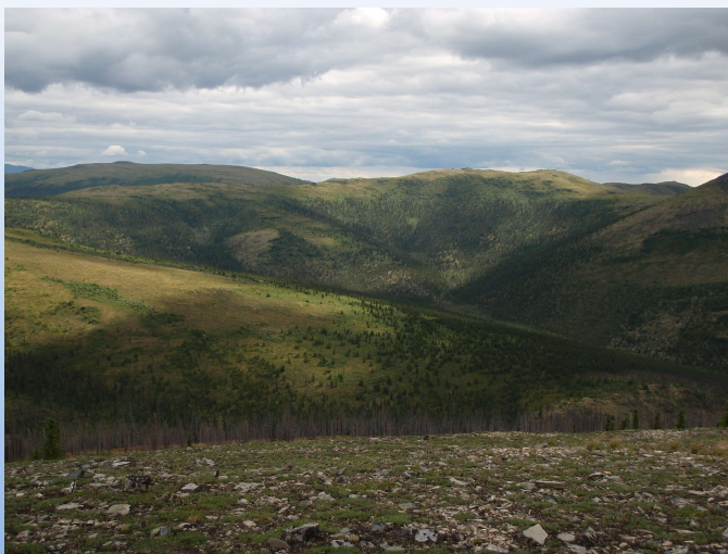
Mount Ryan II: 35,700 Acres 30 Staking Authorizations