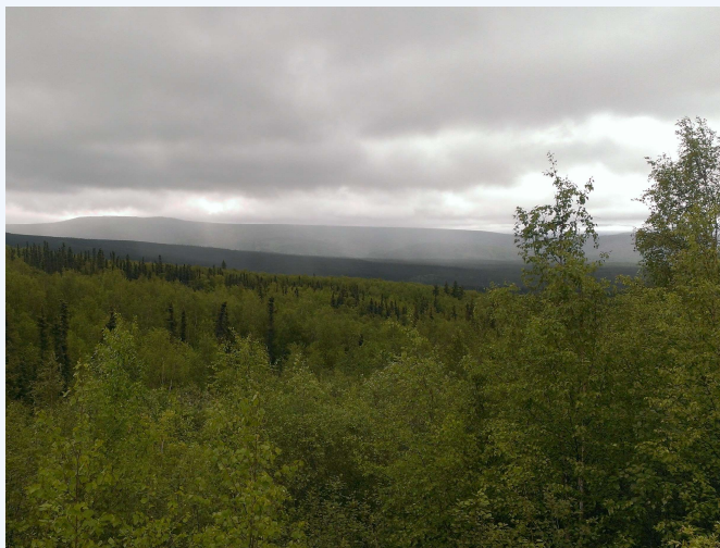
Tatalina II: 6,100 Acres 31 Staking Authorizations