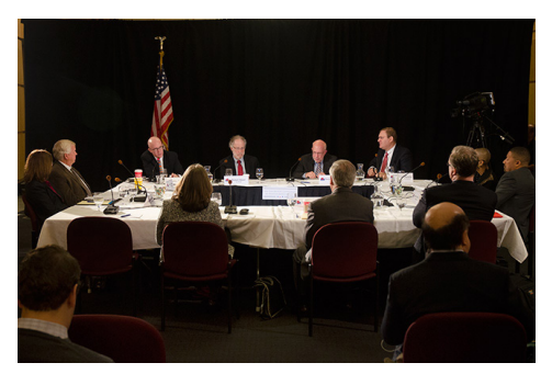
Dec. 3, 2013 Presidential Commission on Election Administration's Final Public Meeting

From an election administration perspective, error-ridden voter rolls require additional time and attention of poll workers in serving voters, thus delaying the overall efficient movement of voters through the polling place.<sup>8</sup> The PCEA found recurring registration inaccuracies cause a whole series of administrative challenges for poll workers in the efficient management of the voting process,<sup>9</sup> resulting in longer lines and wait times for voters.<sup>10</sup>