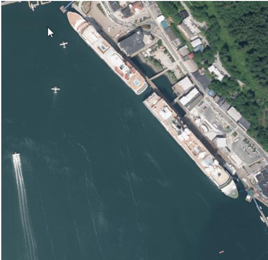
Port of Juneau – Pre-2016