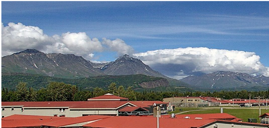
Palmer Correctional Center