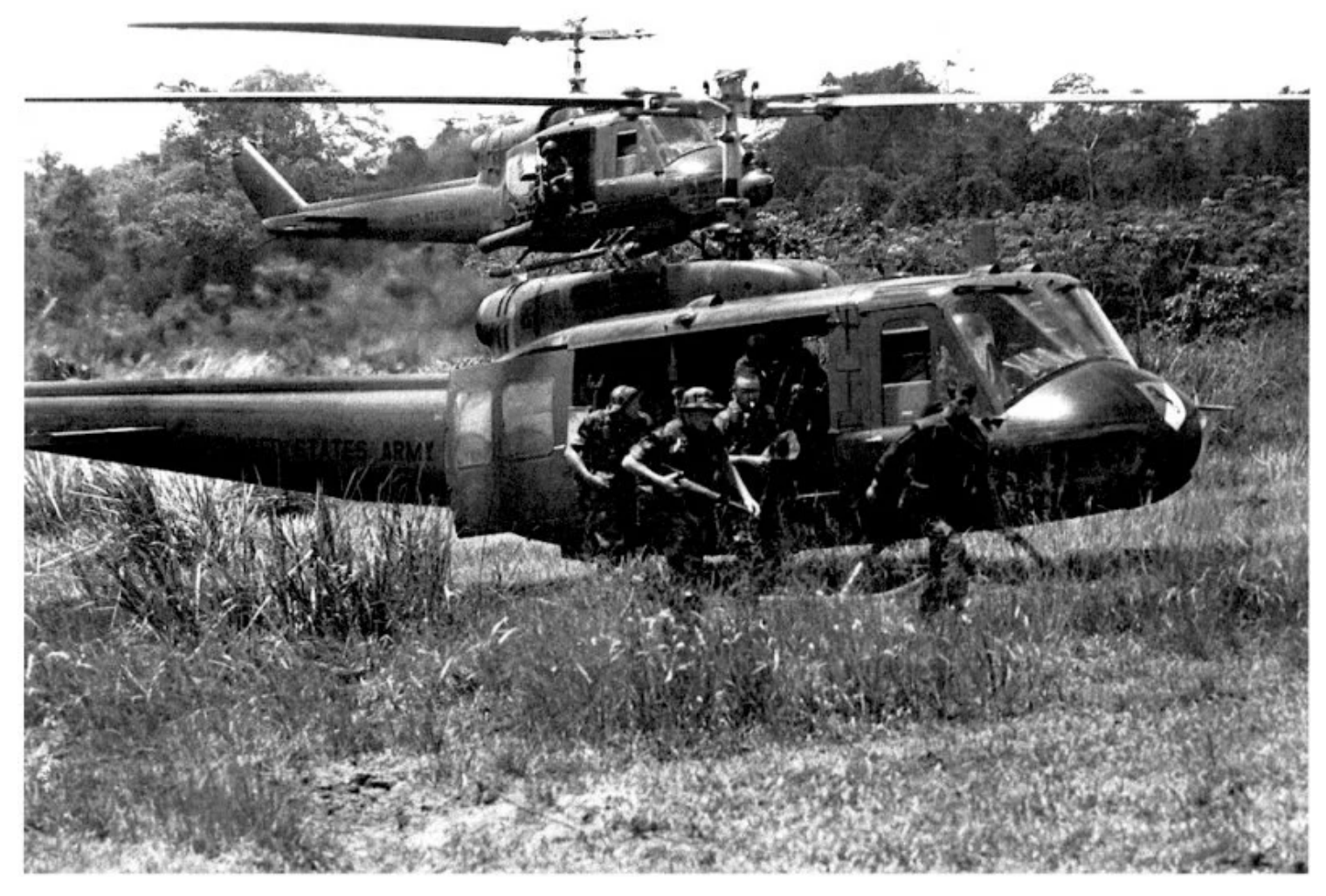
Army helicopters were the workhorses—and ambulances—of the Vietnam war.