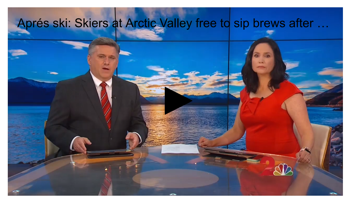
By Melinda Bolton | Posted: Tue 6:05 PM, Aug 14, 2018 | Updated: Wed 12:09 PM, Aug 15, 2018