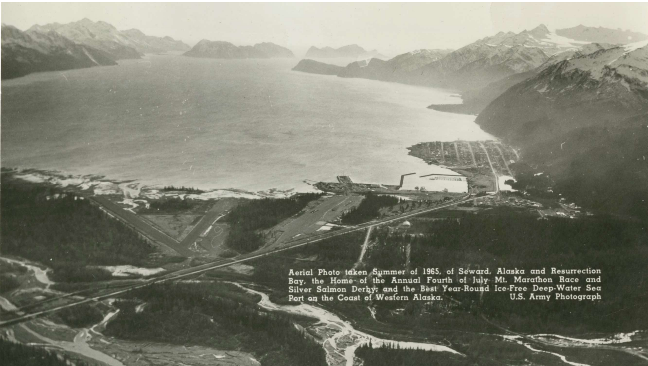
Aerial Photo taken Summer of 1965, of Seward, Alaska and Resurrection Bay, the Home of the Annual Fourth of July Mt. Marathon Race and Silver Salmon Derby; and the Best Year-Round Ice-Free Deep-Water Sea Port on the Coast of Western Alaska.