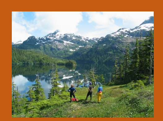
Alaska: "So much beautiful land and water, so little outdoor recreation infrastructure"