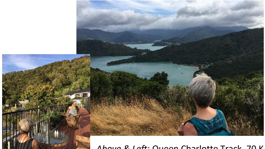
Above & Left: Queen Charlotte Track, 70 K walk: sweet, active days; luxury at night