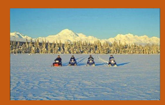
Just another nice ride with a Denali view, on the winter trail system north of Petersville Rd in the Mat Su Borough