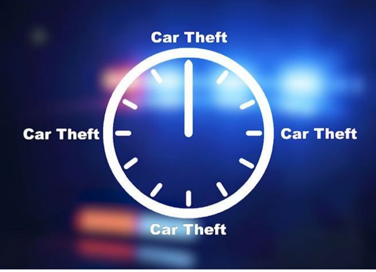
In 2017, a car was stolen in Anchorage every three hours.

This year, APD noted a trend involving repeat offenders. Several cases highlighted one individual responsible for stealing multiple cars, often while out on bail.