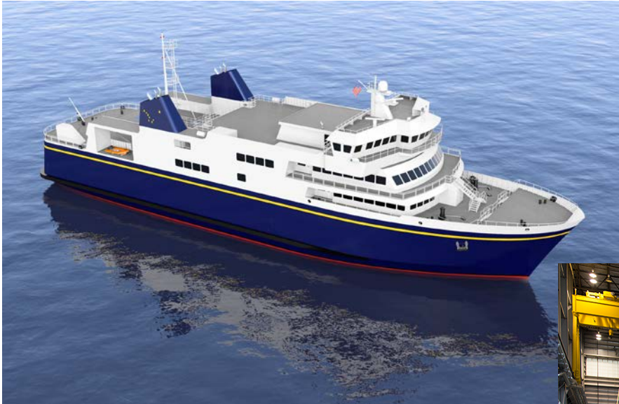
Made in Alaska AMHS replacement vessels