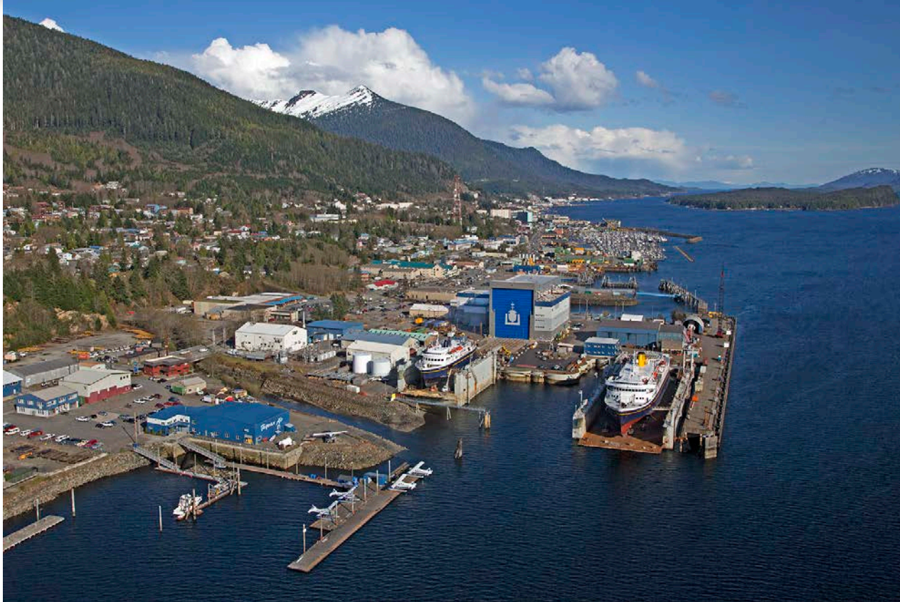
AIDEA's Ketchikan Shipyard - 2017 to long in the future