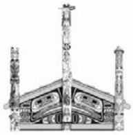
Ketchikan Indian Community