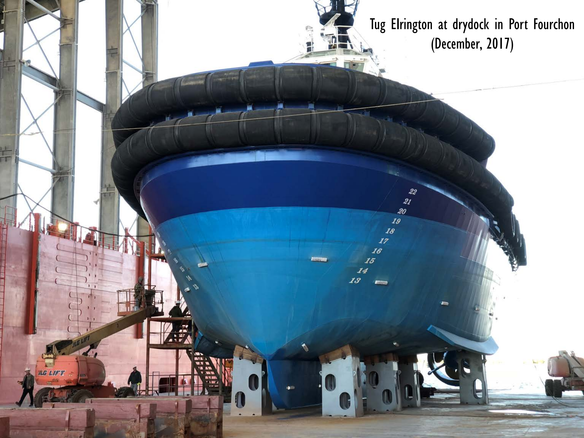
Tug Elrington at drydock in Port Fourchon (December, 2017)