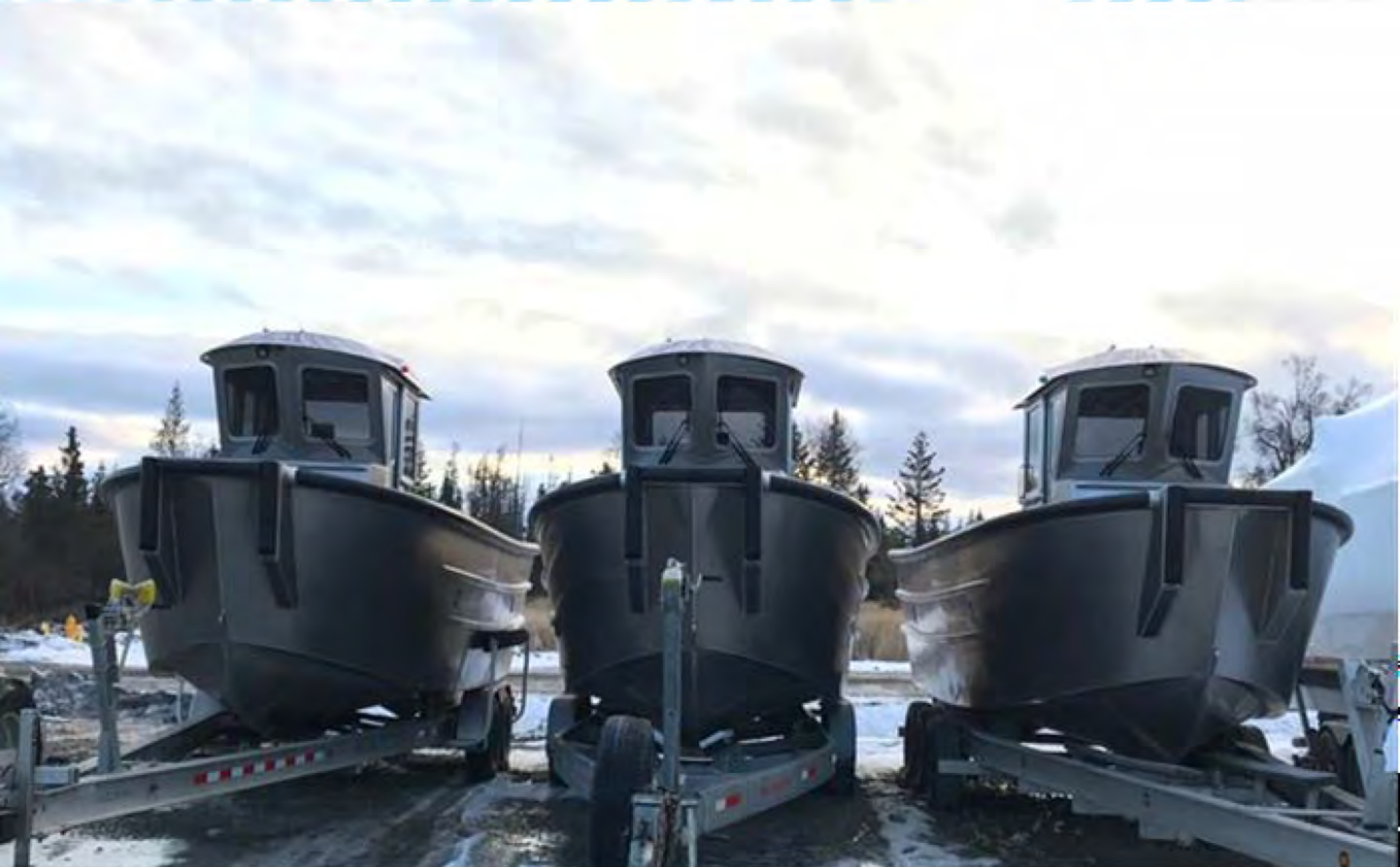
Bayweld, Homer, AK Escort work boats 1-3