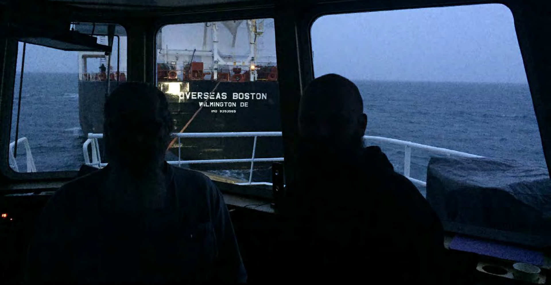
ECO mariners riding a Prince William Sound escort in December