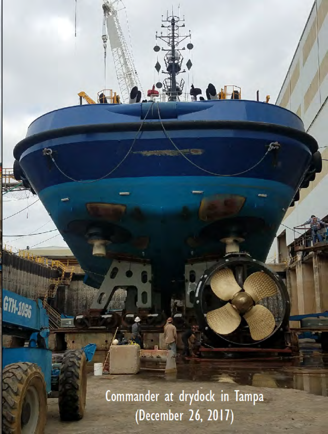
Commander at drydock in Tampa (December 26, 2017)