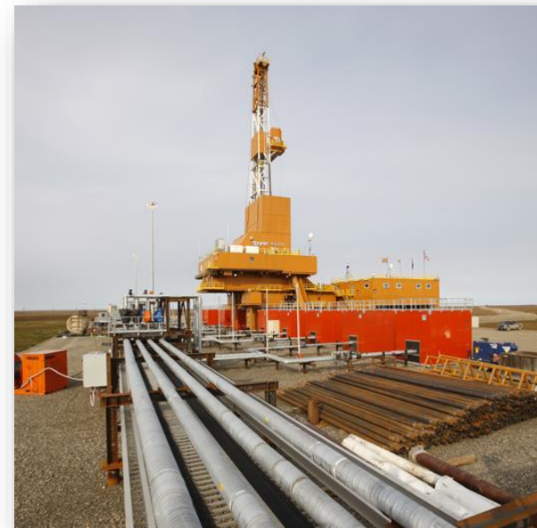
Alaska Capex as % of COP Total ($B)