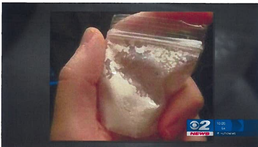
A packet of the synthetic drug U-47700, known as "pink" or "pinky."

10 Comments / Share / Tweet / Stumble / Email