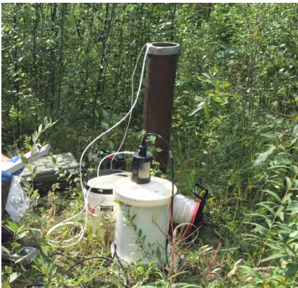
A monitoring well in Moose Creek

A portion of the fuel pipeline for Eielson Air Force Base runs through the residential community of