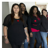
NPR ED Activists Stop Paying Their Student Loans