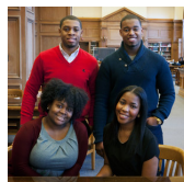
THE HOWARD PROJECT Education May Be Priceless, But A College Degree Isn't