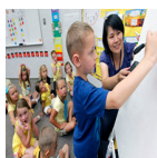
( http://archive.sltrib.com/images/2012/0804/dualimmersion_080112~1.jpg )