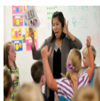
( http://archive.sltrib.com/images/2012/0804/dualimmersion_080112-0.jpg )