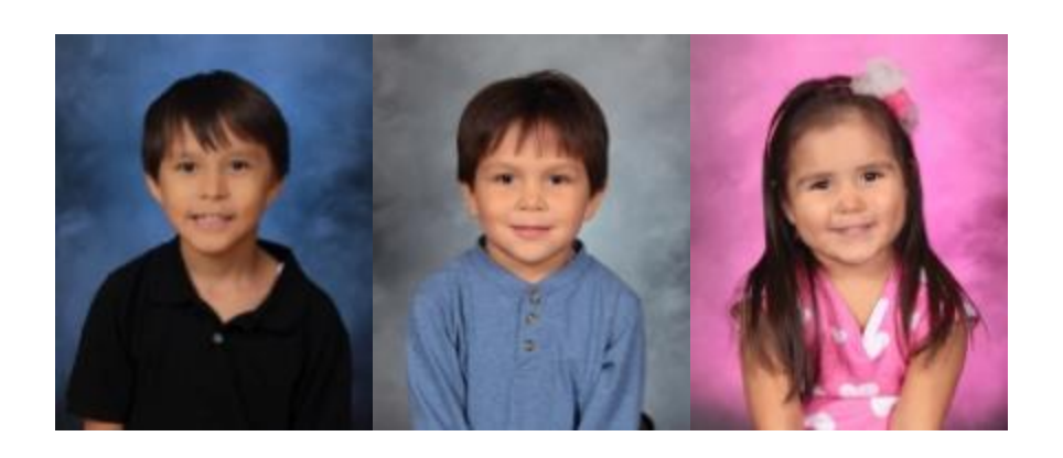
April 10, 2015