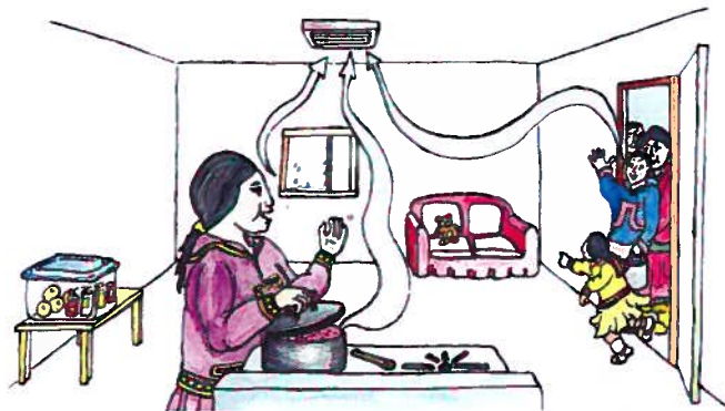
Image from the Alaska Healthy Homes Initiatives' "Help Your Family To A Healthy House"