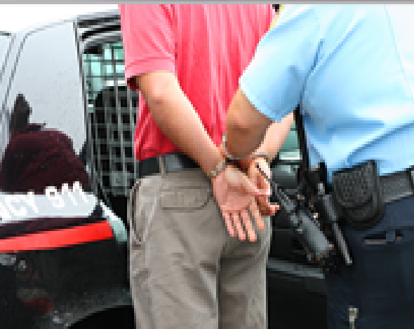
The Problem and Costs to Society

An approach for the judicial system to reduce the influence of drug and alcohol abuse in crime