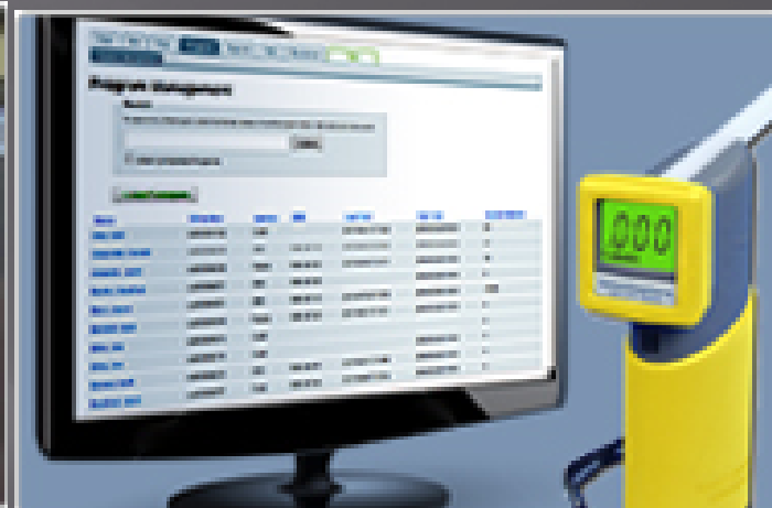
Tools and Products