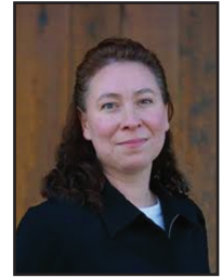
Denise Michels City of Nome Mayor Coastal Community Representative