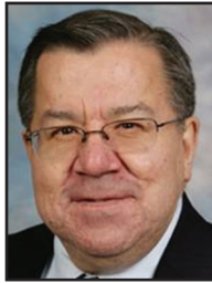
Senator Lyman Hoffman Bethel