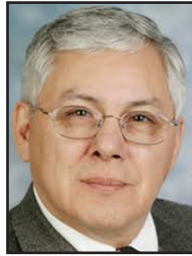
Mayor Reggie Joule The Native Village of Kotzebue Kotzebue IRA Tribal Entity Representative