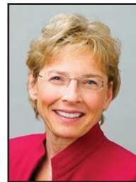
Senator Cathy Giessel Anchorage