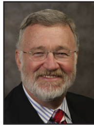
Senator Gary Stevens Kodiak