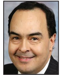
Senator Donny Olson Golovin