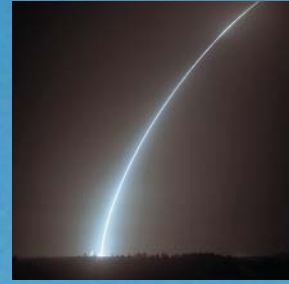
Target vehicle IFT-14 stands ready for lift-off from the Kodiak Launch Complex in February. Insulating shrouds cover the rocket protecting it from the elements. Photos of the countdown, lift-off, and flight of the IFT-14 rocket used here are courtesy of Sandia National Laboratories.