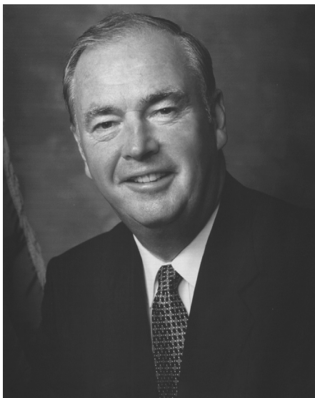
Frank H. Murkowski, Governor