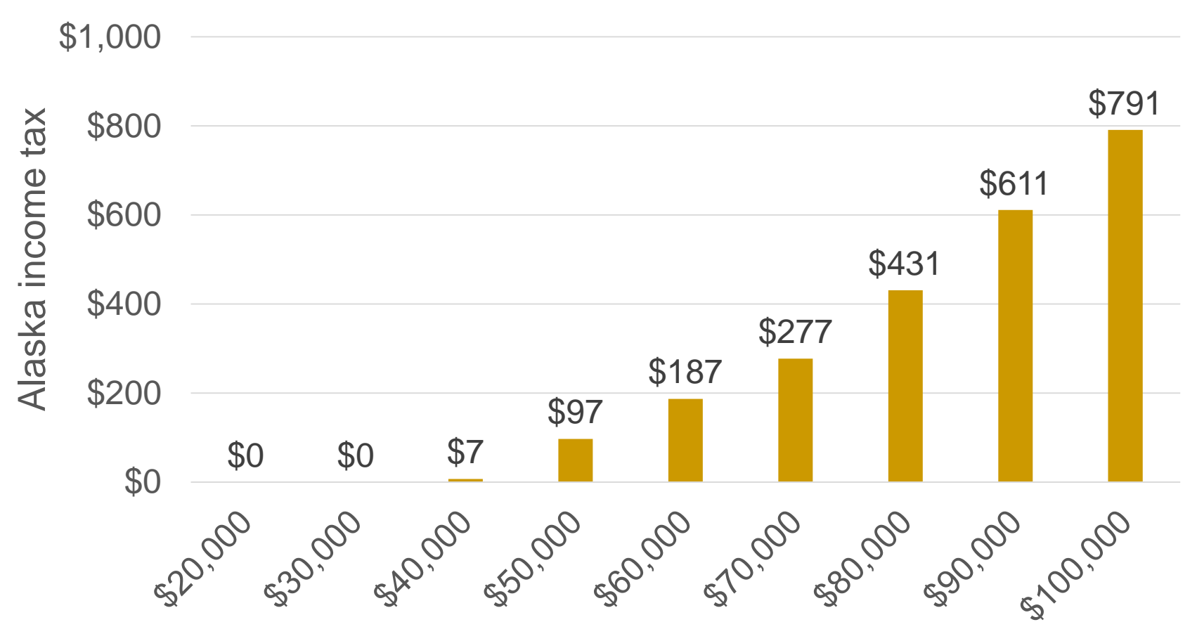
Federal taxable income