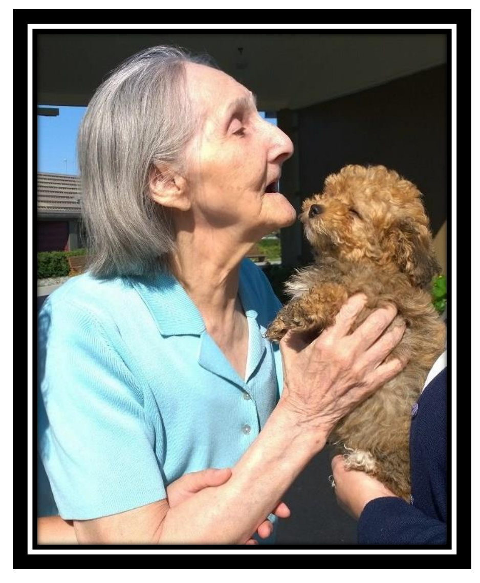
SPECIAL MOMENTS WITH A COMPANION