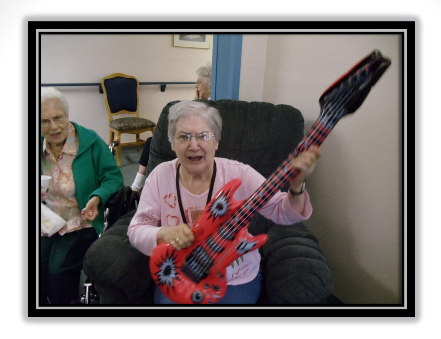
THE SOUND OF MUSIC