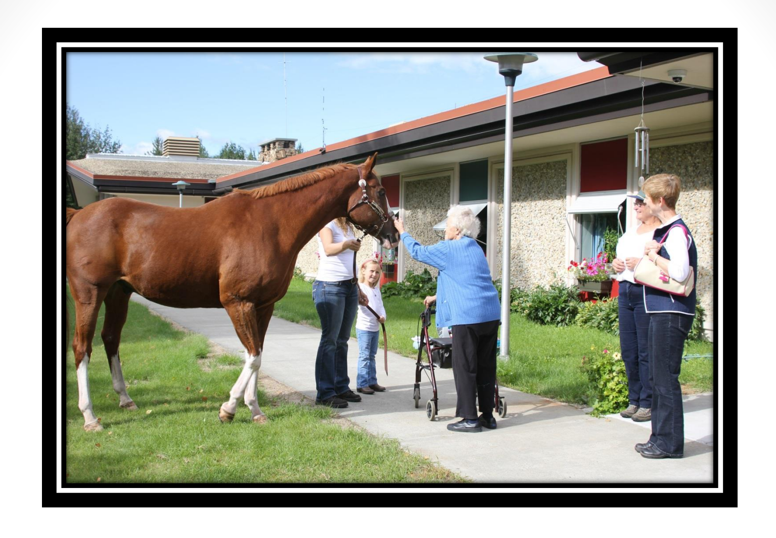
WILDHORSES & YOUNG AT HEART