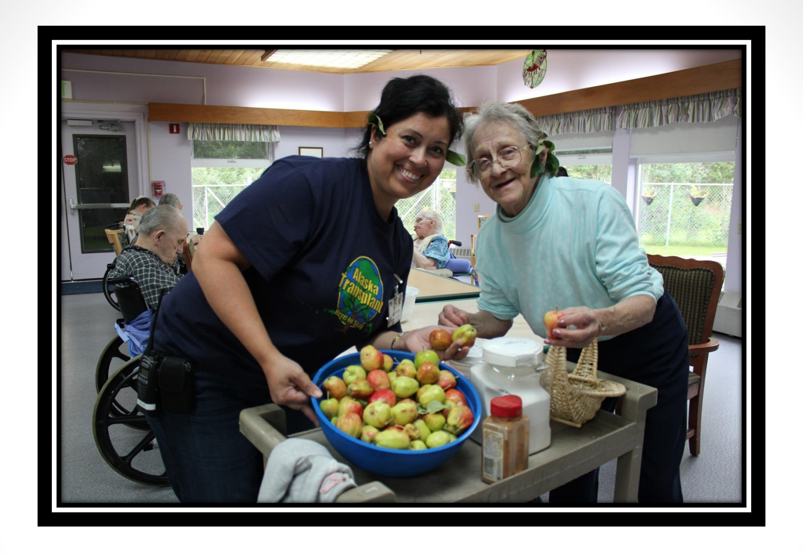
A SUNDAY IN THE KITCHEN: APPLE PIE