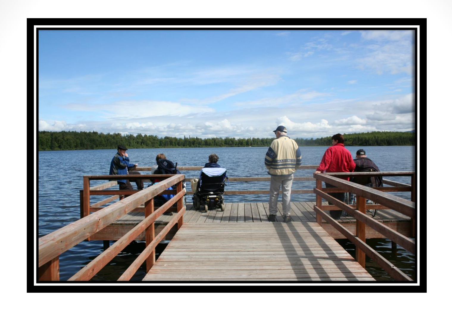
FUN AT BEACH LAKE