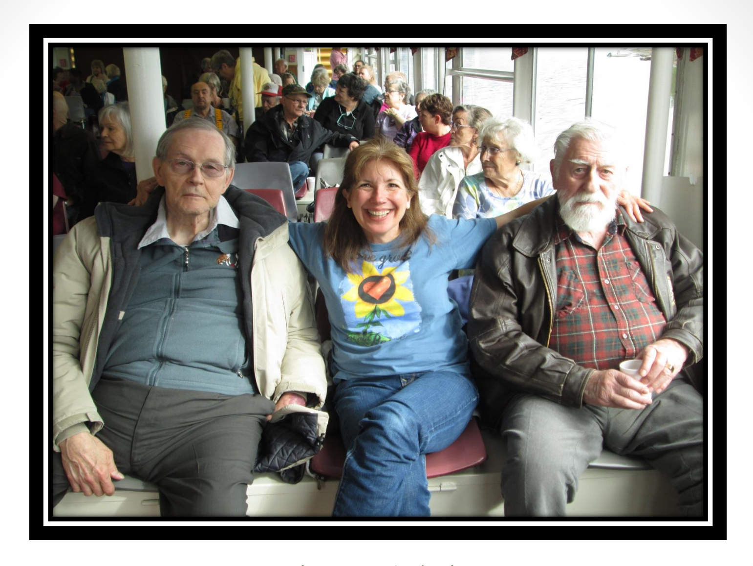
OFFERING FAMILY AND FRIEND INTERACTIONS