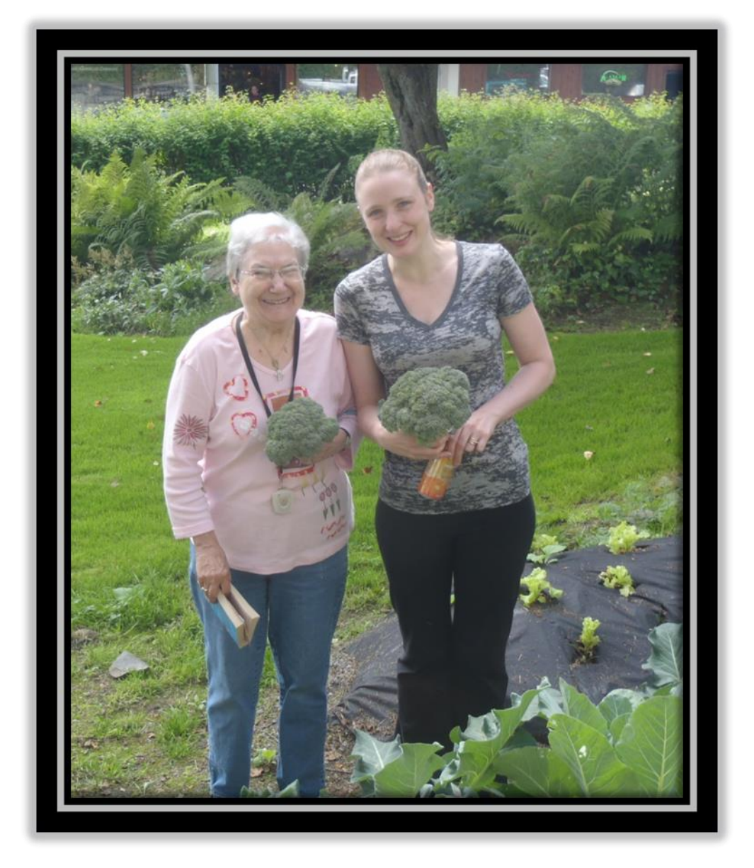
PERSON CENTERED CARE