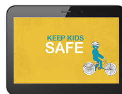
Family Video: Sexual Abuse Should Not Happen to Our Children

The Child Protection Unit lays the groundwork to meet the needs of children who have experienced or are at risk for experiencing maltreatment in an educational setting. Implementation of this unit can help schools strengthen the layers of protection, safety, and support for all students.