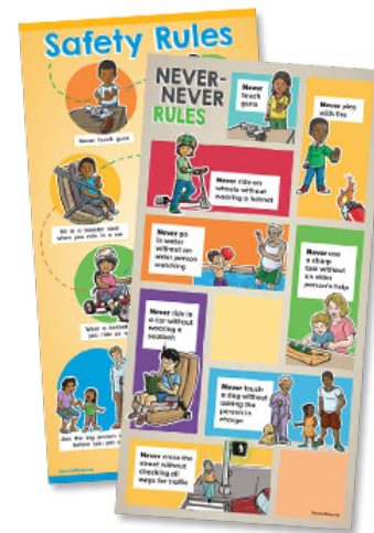
Grades EL–3 Lesson Posters