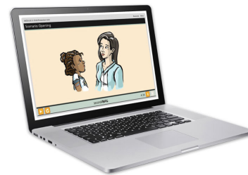
Online Staff Training Module 2: Recognizing, Responding to, and Reporting Abuse

The Child Protection Unit student lessons encourage help-seeking behavior and positive student norms by teaching students to recognize, refuse, and report unsafe or abusive situations. The Child Protection Unit includes an array of teaching modes and gives students multiple opportunities to practice skills. Specifically, the lessons aim to help children protect themselves by teaching them skills in three areas: (a) recognizing unsafe and sexually abusive situations and touches, (b) immediately reporting these situations to adults, and (c) assertively refusing these situations whenever possible. Each lesson also includes an activity children can do with a parent or caregiver at home to practice the skills.