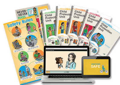
Grades EL-3: Child Protection Unit

To learn more about Second Step products, please visit: