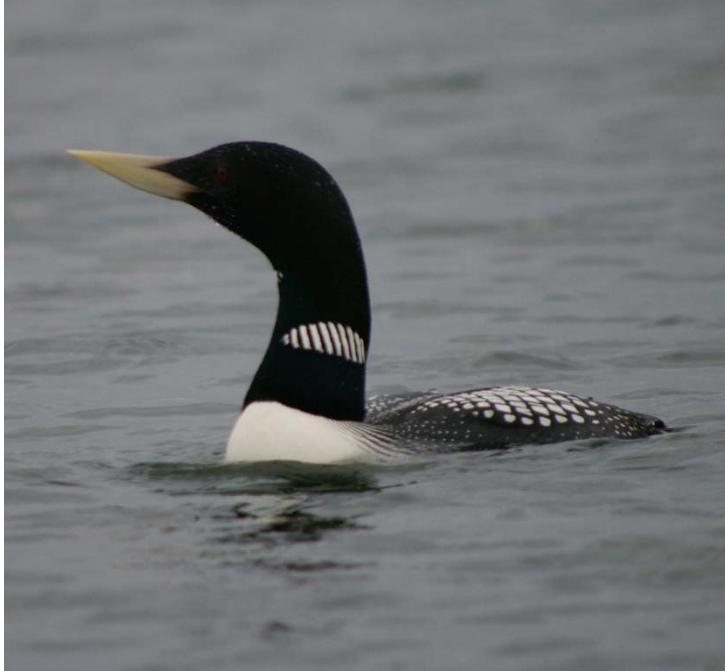
Yellow-billed loon former Candidate ESA species – nests on North Slope