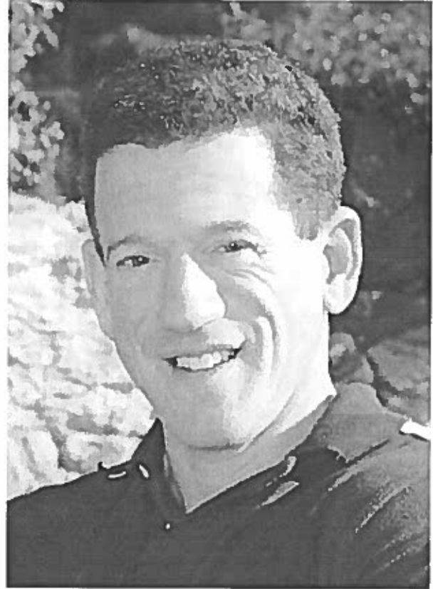
Judicial Council's conduct troubling

Unfortunately, this famous quote came to my mind when I thought about Alaska's Judicial Council. The Alaska Constitution established the Council with the intent to conduct studies for improvement of the administration of justice in Alaska and to make recommendations to the Alaska Legislature and Supreme Court. However, over the past decades, we've seen the power of this body expand, as well as its involvement in partisan politics. The Council's role has expanded to be an advocate for or against judges, with no apparent ethics oversight. The Council's conduct is also troubling, as it appears to actively lobby for the nomination and retention of judges it likes and to lobby against judges it would like to replace. To me, based on its most recent actions, the Alaska Judicial Council does not reflect the values of most Alaskans and is no longer a credible body.