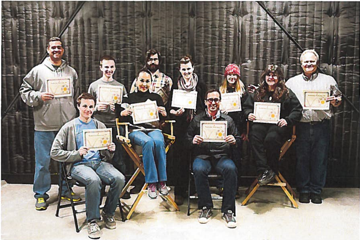
March 9, 2013 Film Workshop Students