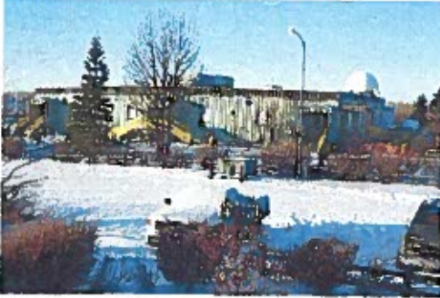
Two Seasons Dining Hall