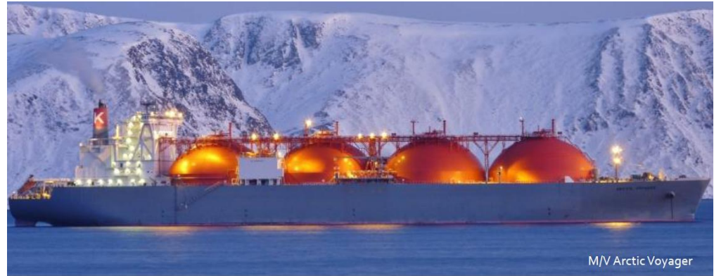
M/V Arctic Voyager