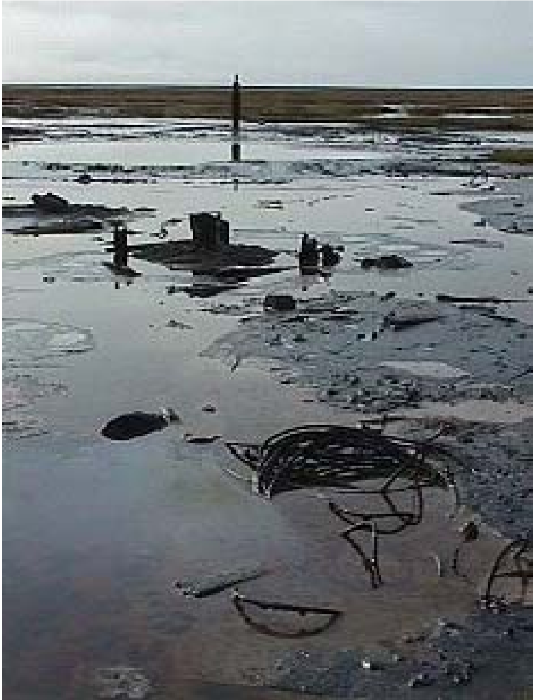
Wellhead along with wood and metal debris in a natural oil seep