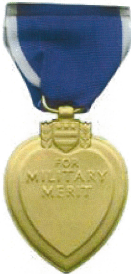
Purple Heart (reverse)

Army regulations specified the design of the medal as an enamel heart, purple in color and showing a relief profile of George Washington in Continental Army uniform within a quarter-inch bronze border. Above the enameled heart is Washington's family coat of arms between two sprays of leaves. On the reverse side, below the shield and leaves, is a raised bronze heart without enamel bearing the inscription "For Military Merit." The 1 11/16 inch medal is suspended by a purple cloth, 1 3/8 inches in length by 1 3/8 inches in width with 1/8-inch white edges.