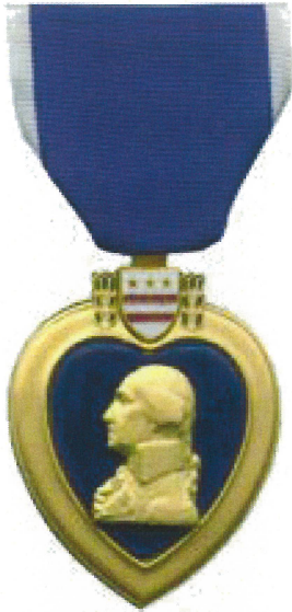
Purple Heart (obverse)