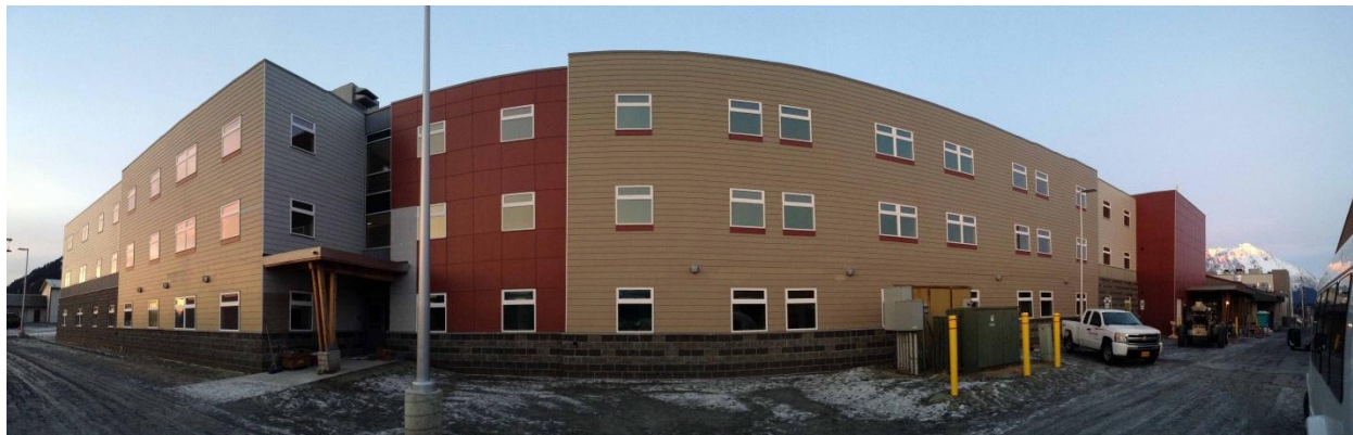
DOL- AVTEC Dormitory (Seward)