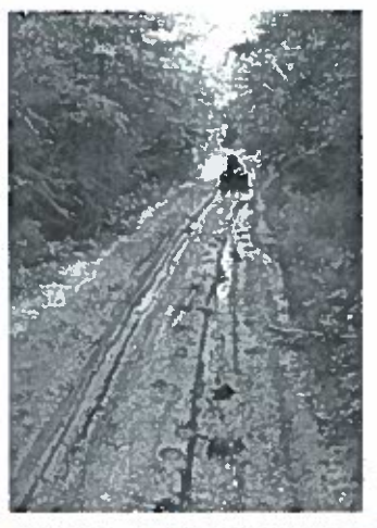
Above center—Bryce Wrigley's ATV is stuck in the mud on a portion of Bluff Cabin Trail. This is a potential NRCS rehabilitation project in the near future.