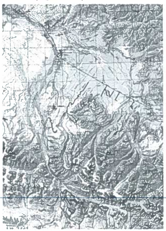
Above left—Red lines on the map indicate the inventoried trails.

Using GPS units, Colin and Will tracked the centerline of the trails, as well as collected geo-referenced photo points of resource concerns and general features of the trail. These include stream crossings, culverts, benches, signs, restrooms, scenic overlooks, camping areas and public use cabins.