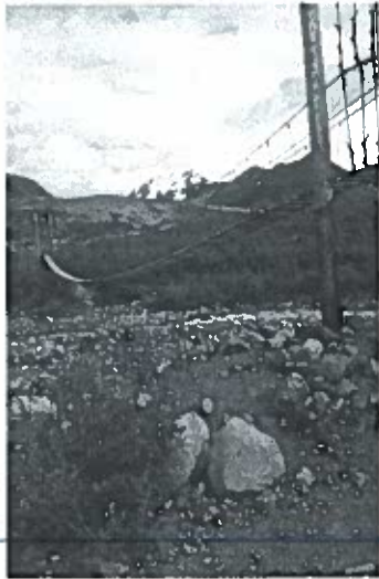
Above right—A suspension footbridge on the Gulkana Glacier Trail near Summit Lake.