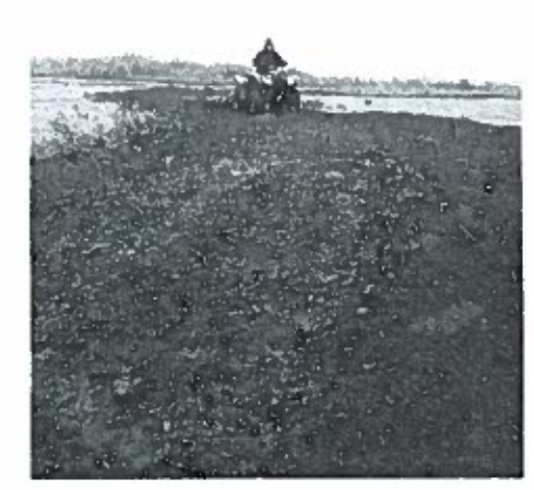
Above—A berm is lightly dragged by a SWCD employee on an ATV after grass was seeded and fertilized on the bison range.

Each range is unique in its location, forage species, and utilization by bison and other wildlife species.