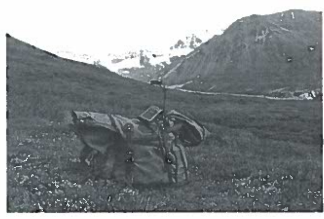
Above—GPS equipment used in the trail inventory above McCallum Creek in the Alaska Range.

The collected information will be useful to not only assist NRCS in identifying areas for possible future rehabilitation projects, but also to the District. The District plans to utilize the information to create a Delta Junction area trail guide available in both booklet form and KML format, which can be downloaded and viewed in Google Earth. This will significantly increase available outdoor recreational opportunities for local residents and visitors alike. 2