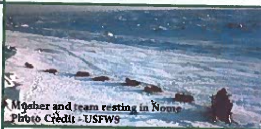
Musher and team resting in Nome