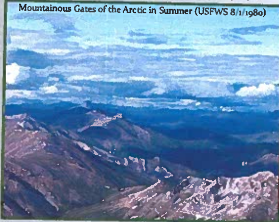
Mountainous Gates of the Arctic in Summer (USFWS 8/1/1980)

For more information please contact Greg Dudgeon, Superintendent, Gates of the Arctic National Park and Preserve, 4175 Geist Road, Fairbanks, AK 99709-3420; telephone (907) 457-5752. ♦