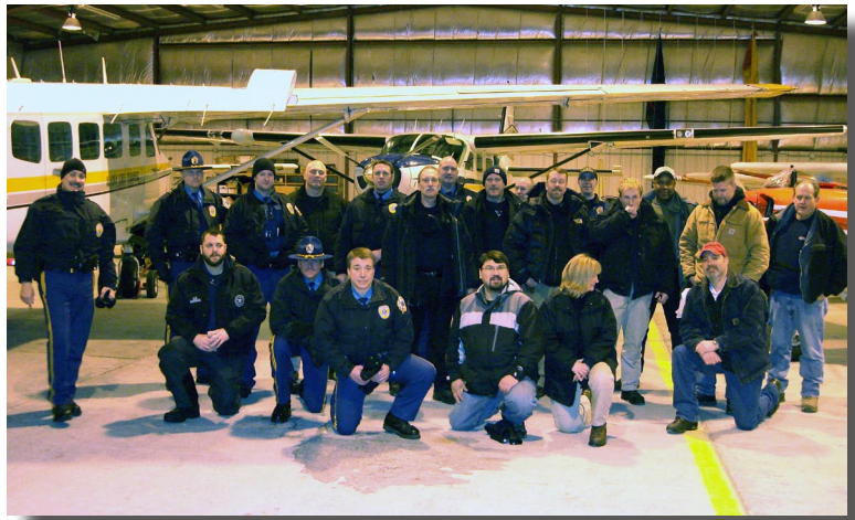
Alaska State Troopers and Deputy U.S. Marshals snapped a group shot in front of AST's two Caravans before heading into the field. The Caravans were used extensively during the operation to transport prisoners and officers.

More than a dozen firearms were seized during the compliancy contacts that took place in the Y-K Delta. Most of the weapons were discovered in Emmonak. It is against both state and federal law for a felon to have firearms in their possession or in their home, regardless of who owns the gun. The weapons had to be identified and logged then transported to a secure evidence holding facility in Bethel.