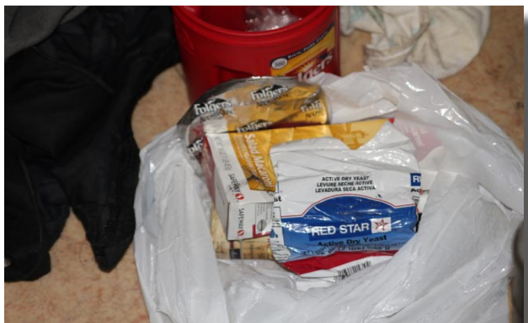
Yeast is one of the main ingredients for making home-brew. Troopers found an empty bag thrown away while investigating allegations of manufacturing alcohol during a case in Emmonak, AK.