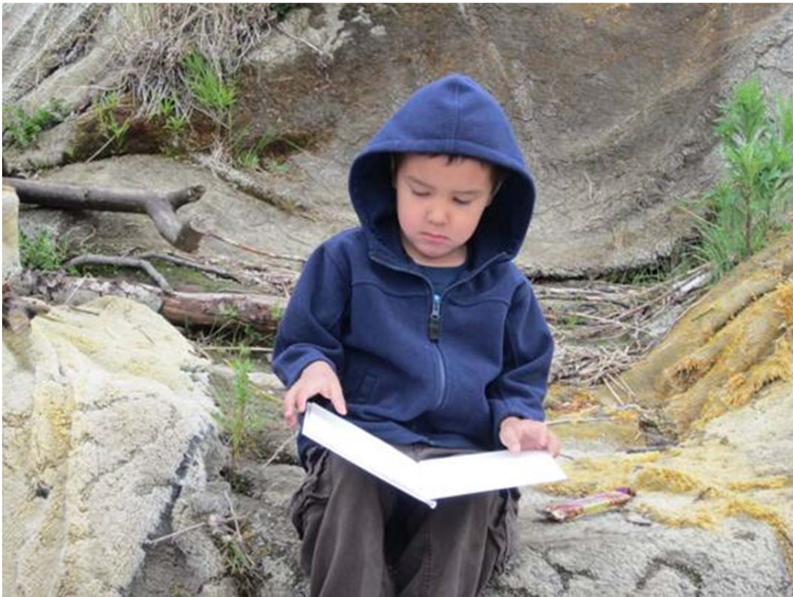
Photo: Young boy from Kwethluk, AK at fish camp on the Kuskokwim reading after receiving a badges-and-books gift.

The day's event was received well by the children and parents and will continue throughout the summer on both the Yukon/Kuskokwim Delta's.